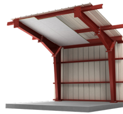
Engineered Metal Building Ceiling